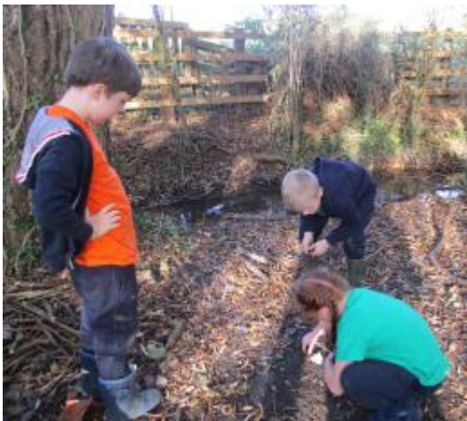
Top: PE with Owls bubble.