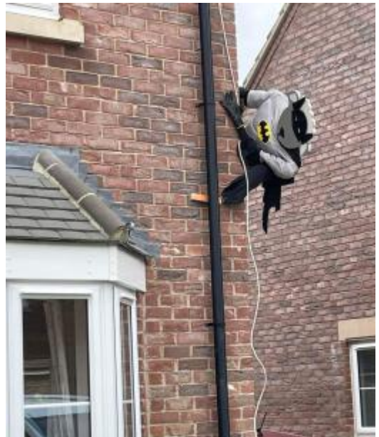
Left: First place - Baariana Grande Top: Second place - Baatman Below: Third place - Wooliam Shakespear the Beard